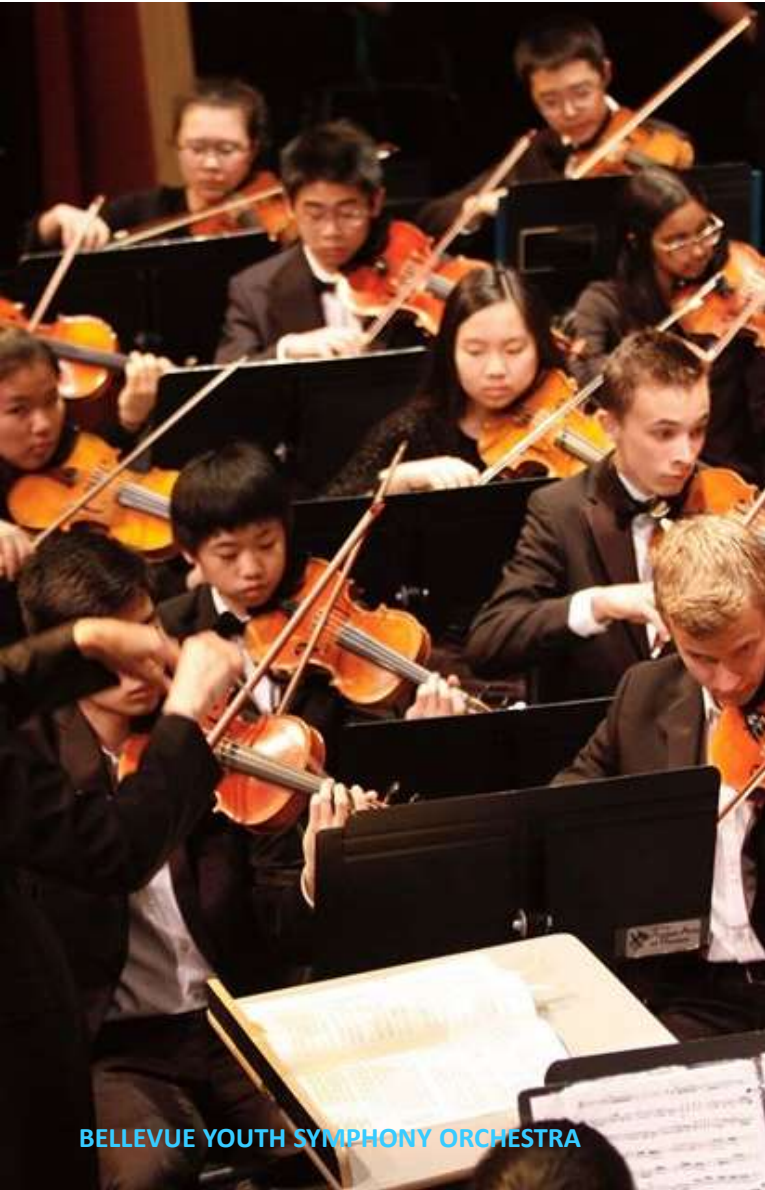
BELLEVUE YOUTH SYMPHONY ORCHESTRA