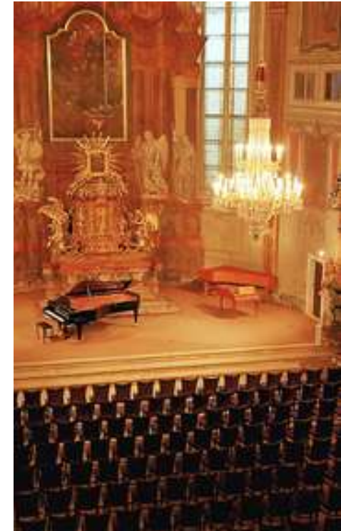
Church of St. Simon and Jude