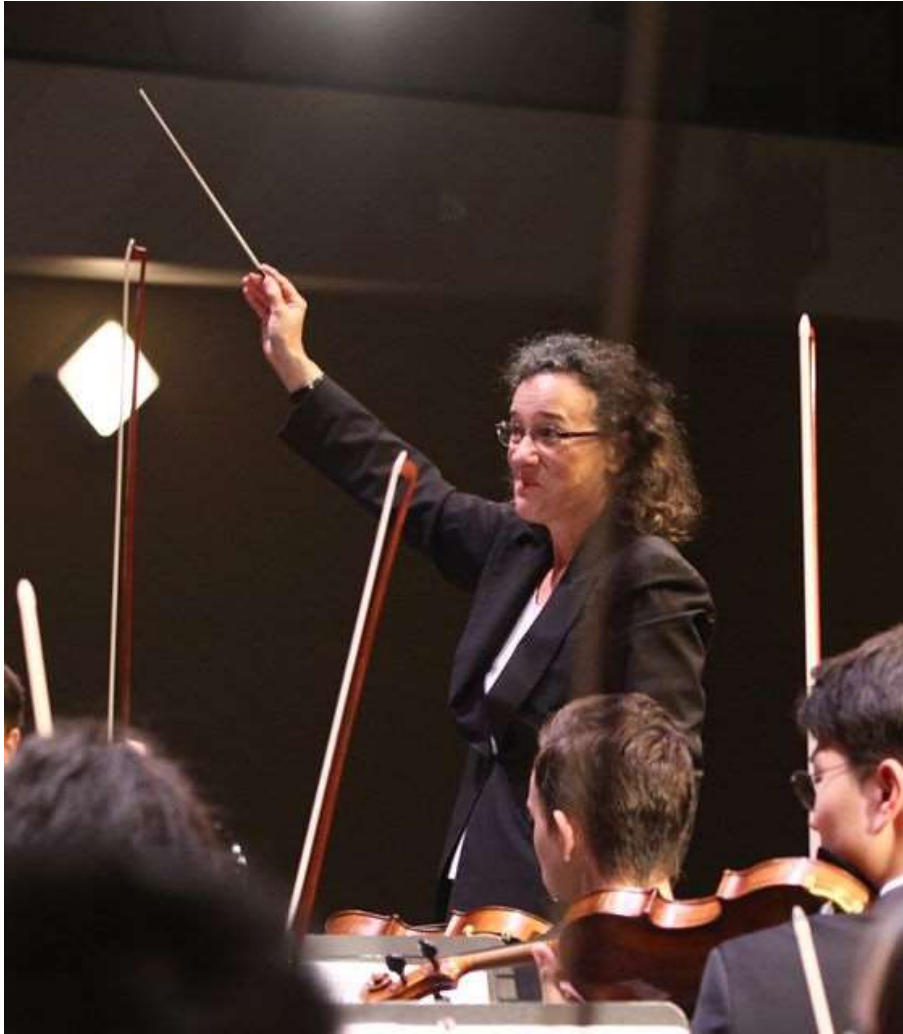
BELLEVUE YOUTH SYMPHONY ORCHESTRA